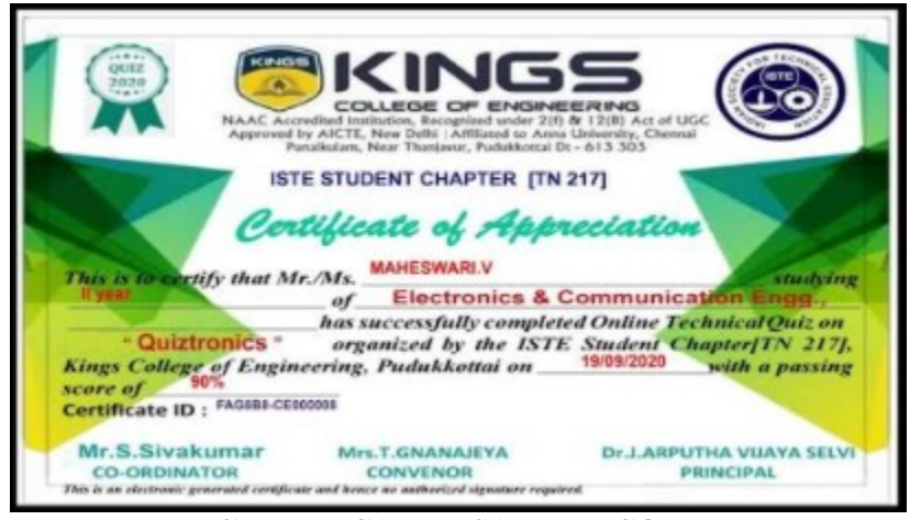
CERTIFICATE – SAMPLE COPY