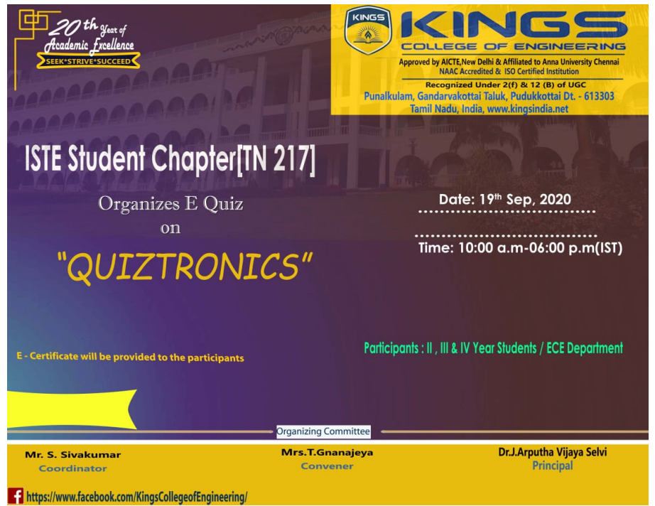
E - QUIZ BROCHURE

3. Students also asked to conduct this kind of Technical Quiz in future. Students were very much interested to answer the Electronics related questions.